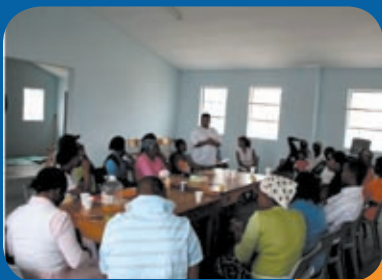
Masi Baptist saw 25 people exploring the clubs

As this first group settles into its routine, so we will launch more groups in Masiphumelele, Red Hill, Capricorn and Ocean View. We are excited to see how the members of Masikhule will take up the torch – sharing their experiences and being empowered to teach others to save.